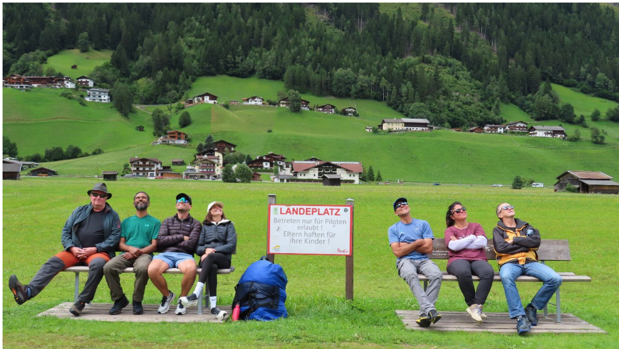
Some 2025 happy faces photos — those grins say it better than words ever could!